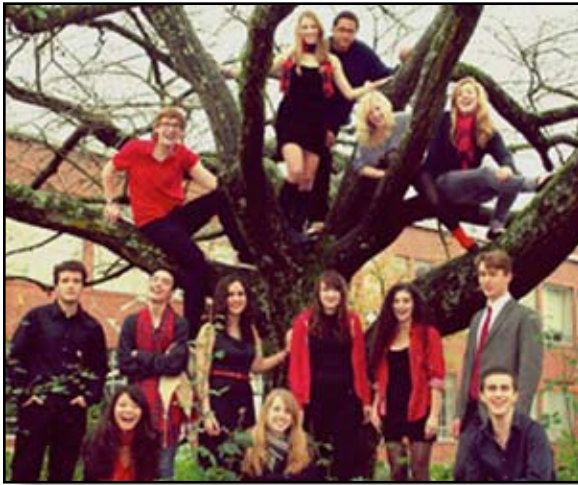
Lincoln High School Drama students.

Those families who can afford to pay for their students to go have done so, but there are many students who cannot afford the trip. We have been fundraising as a group on their behalf. We've held auctions, house parties, talent shows, car washes etc. in an attempt to raise funds. We still have a ways to go.