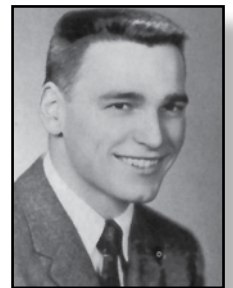
Class of '57